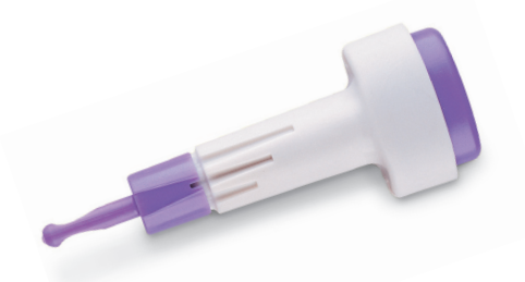
The ACCU-CHEK Safe-T-Pro Plus lancet: minimizes inventory costs and uses a unique technology for ensuring patient comfort and staff safety.

Engineered to help clinicians provide quality patient care, the single-use, multi-depth ACCU-CHEK Safe-T-Pro Plus lancet brings comfort and safety to patients and clinicians.