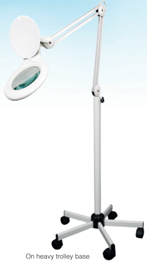
On heavy trolley base

This LED magnifying lamp is very popular in dermatology, and whenever precise and detailed examinations are necessary. The articulated metal arm and swivel joint makes the light easy to adjust and position. The magnifying glass comes with a protective cover, and a desk-clamp is supplied as standard.