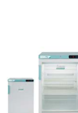
Under-counter Control Plus Refrigerator 158L

PPSR47UK / 444410570 (solid) PPGR47UK / 444410572 (glass)