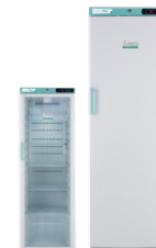
Upright Control Plus Refrigerator 353L

PPSR158UK / 444410526 (solid) PPGR158UK / 444410527 (glass)