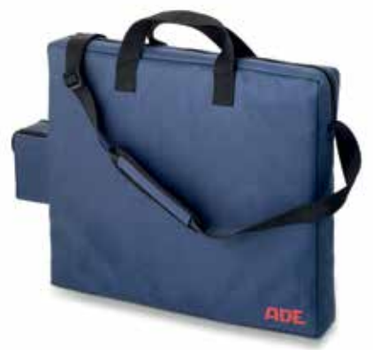
Carrying bag for floor scales ADE MZ10062