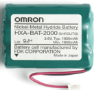
BATTERY PACK HXA-BAT-2000