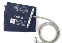
LARGE CUFF 32-42cm HXA-GCFL-PBE (with 1 m tube) HXA-GCFL-PCE (with 4.5 m tube)