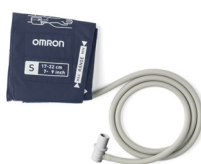
SMALL CUFF 17-22cm HXA-GCFS-PBE (with 1 m tube) HXA-GCFS-PCE (with 4.5 m tube)