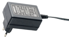
AC ADAPTER-E1600 AC ADAPTER-UK1600