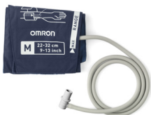
MEDIUM CUFF 22-32cm HXA-GCFM-PBE (with 1 m tube) HXA-GCFM-PCE (with 4.5 m tube)