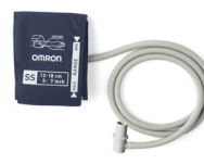
XSMALL CUFF 12-18cm HXA-GCFXS-PBE (with 1 m tube) HXA-GCFXS-PCE (with 4.5 m tube)