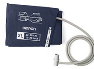
XLARGE CUFF 42-50cm HXA-GCFXL-PBE (with 1 m tube) HXA-GCFXL-PCE (with 4.5 m tube)