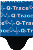
5400 Resting ECG Tab

The 5400 sets the industry standard for resting ECG tab electrodes. This tab electrode features our most popular level of adhesion suitable for most diagnostic applications.