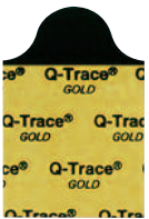
Gold 5500 Resting ECG Tab

The 5400 sets the industry standard for resting ECG tab electrodes. This tab electrode features our most popular level of adhesion suitable for most diagnostic applications.